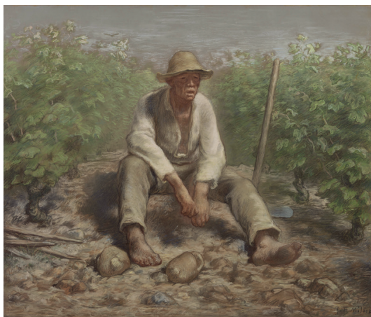
8 Jean-François Millet, Vigneron au repos , circa 1870, Pastels and Crayon on Paper, 70,5 x 84 cm, De Mesdag Collectie, Den Haag.

Millet's life path can also be read as a conscious reduction of the urban-modern experience: His escape from Paris to Barbizon tries to exclude the modern and alienating impressions of the city. He deliberately chooses an environment shaped by the rural instead of the cramped workers' blocks, the oppressive air, and the crowds of Paris. Millet also shows an interest in pre-modern culture and times. Multiple sources describe how, even while in Paris, he immersed himself in texts by Homer or the Bible and sought refuge in the Louvre among the old masters. 48 Millet himself states that he does not intend to create art for society, but rather to show true conditio humana in natura naturans . 49