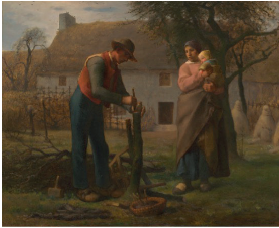
15 Jean-François Millet, Un paysant greffant un arbre, dit Le Greffeur , 1855, Oil on Canvas, 80,5 x 100cm, Neue Pinakothek, München.

a supposed productive unity with nature. Environment thereby becomes the site of labour, and labour upon it the moment of de-alienation. 61 Millet's natura naturans aims therefore not a pastoral-Arcadian idyll, but rather a site of sincere, authentic humanity within environment — in the sense of the biblical dictum: “In the sweat of thy face shalt thou eat bread.” 62