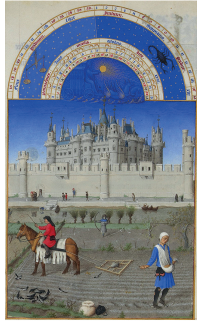
3 Limburg Brothers, Très Riches Heures (October), circa 1415, 29 x 21 cm, Musée Condé, Chantilly.