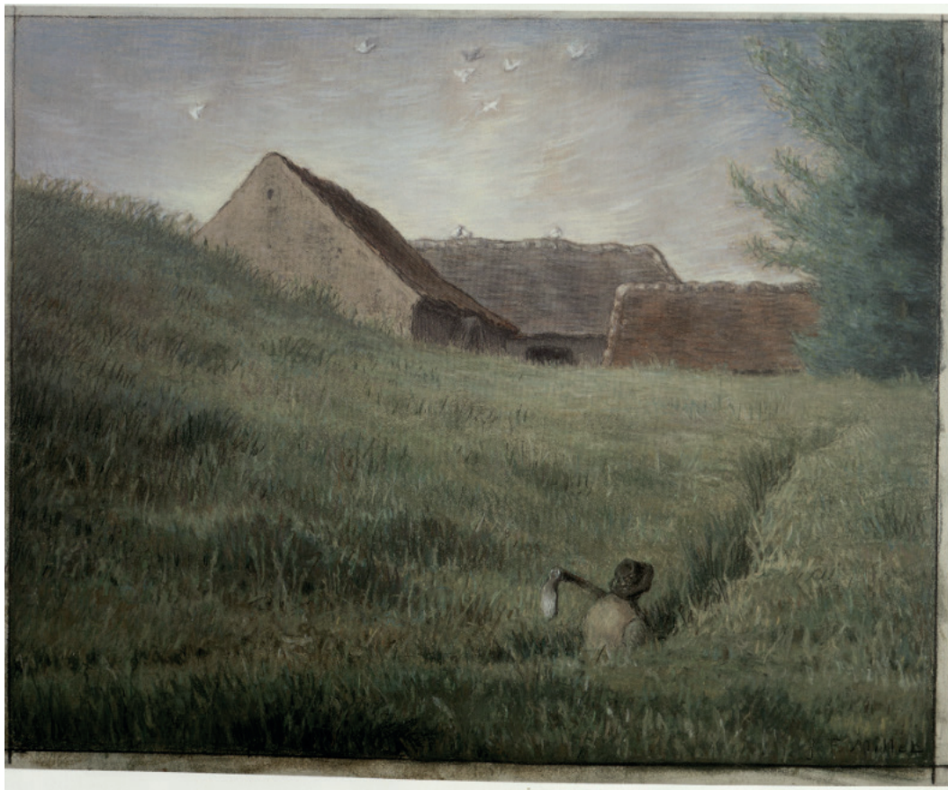
1 Jean-François Millet, Chemin à travers les blés , circa 1867, Pastels and Crayon on Paper, 40 x 50,8 cm, Museum of Fine Arts, Boston.