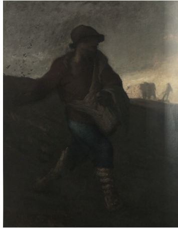
11 Jean-François Millet, Le Semeur , 1850, Oil on Canvas, 99,7 x 80 cm, Yamanashi Prefectural Museum, Kofu.

haustion. In this exhaustion resulting from rural labour lies the integrative moment: the soles of his feet are stained with earth, which had collected in the soles of his discarded slippers and transferred to his feet through work. The colouring of skin and clothing only slightly separates from the earth, and the perspective nests the winemaker in the vines, which close behind him and spread around him; this creates the effect of an integrative unity of wine-