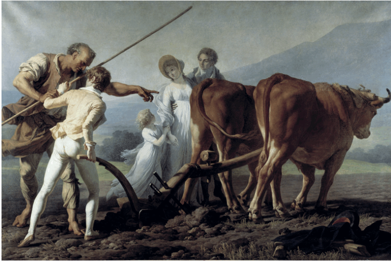
7 François-André Vincent, La Leçon de labourage ou L'Agriculture , 1798, Oil on Canvas, 213 x 313 cm, Musée des Beaux-Arts, Bordeaux.

anecdote further illustrates this deliberate exclusion of modernity: When Millet notices that shepherds in Barbizon wear modern military coats instead of their traditional cloaks, he has a cloak sent from Normandy to outfit a shepherd painting accordingly. 41 He thus alters the shepherds' existing clothing with great effort, intervening reductively and thereby destructively in reality. Furthermore, from 1848 onward, there is