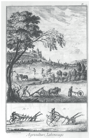
6 Anonymous, Agriculture et économie rustique - Labourage , 1765. Copper Print.

by the Limbourg brothers reveals that the scene could just as well take place in medieval agriculture. While agriculture was rapidly modernizing in the nineteenth century, harvesting machines or steam plows should at least have been used occasionally in Barbizon, Millet consciously excludes these elements. 40 Diderot's Encyclopédie (1751) reports on simple machines such as the seed drill and the cart plow, which were already common in the 18th century. When comparing L'homme à la houe (Fig. 4) or Le Semeur with illustrations of agricultural machines (Fig. 5 and Fig. 6) from the Encyclopédie , it is remarkable that Millet does not equip his peasants with these helpful devices. Thus, Millet excludes not only industrial steam-powered tools but also those that were already in use before industrialization. An