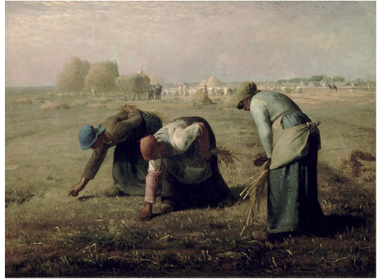
13 Jean-François Millet, Des glaneuses , 1857, Oil on Canvas, 83,5 x 110cm, Musée d'Orsay, Paris..

mediator, aims to reveal this idea of natura naturans to the viewers and, through the experience of his paintings, to re-integrate them as well. 57