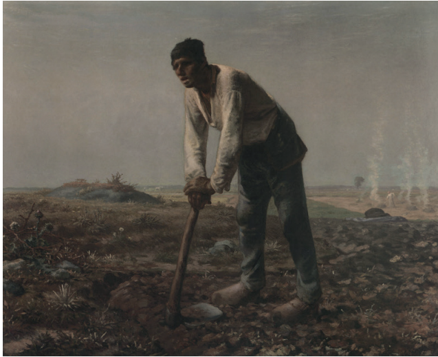
4 Jean-François Millet, L'Homme à la houe , circa 1860-1862, Oil on Canvas, 80 x 99,1 cm, The Paul-Getty-Museum, Los Angeles.