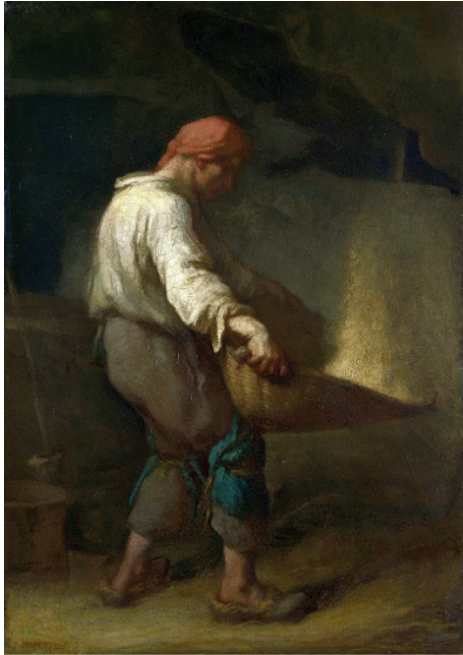
14 Jean-François Millet, Un vanneur , circa 1847-1848, Oil on Canvas, 100,5 x 71 cm, National Gallery, London.

In Millet's works, work on and with the non-urban environment becomes tangible as an appropriative, re-appropriating concept: first, L'homme à la houe sweaty loosens and fertilizes the soil in autumn; then Le Semeur plants the seeds in spring; Chemin à travers les blés shows the fertile field flourishing in summer; Le Faneur proceeds to harvest; Des Glaneuses (Fig. 13) gather leftover grains; and Un Vanneur (Fig. 14) separates the chaff from the wheat. Afterwards, the chaff is burned to fertile ash on the field, as visible in the background of L'homme à la houe , and the cycle begins anew. Millet's figures thus act productively on their surroundings, are shaped by it, and shape it themselves. They enter a relation to the world and integrate themselves into the environment and the circle of year.