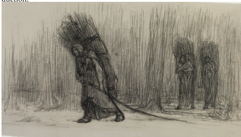
9 Jean-François Millet, Porteuses de fagots rentrant de la forêt , circa 1853-54, Pastels and Crayon on Paper, 28,6 x 46,7 cm, Museum of Fine Arts, Boston.

In Millet's works and life, means of integration into environment stand out. This expresses Millet's specific conception of the conditio humana , shaped by the interconnectedness and integration of humans with environment. A prerequisite for this union is the destruction of the modern-urban through reduction.