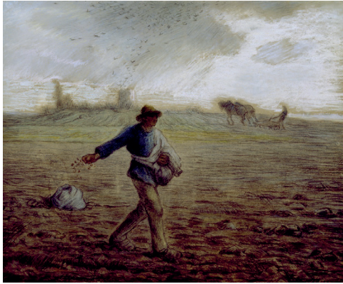
12 Jean-François Millet, Le Semeur , circa 1865, Pastels and Crayon on Paper, 43,5 x 53,5 cm, The Walters Art Museum, Baltimore.