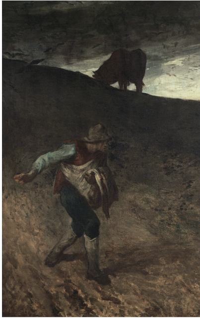
2 Jean-François Millet, Le Semeur , 1847, Oil on Canvas, 95,3 x 61,3 cm, The National Museum of Wales, Cardiff.