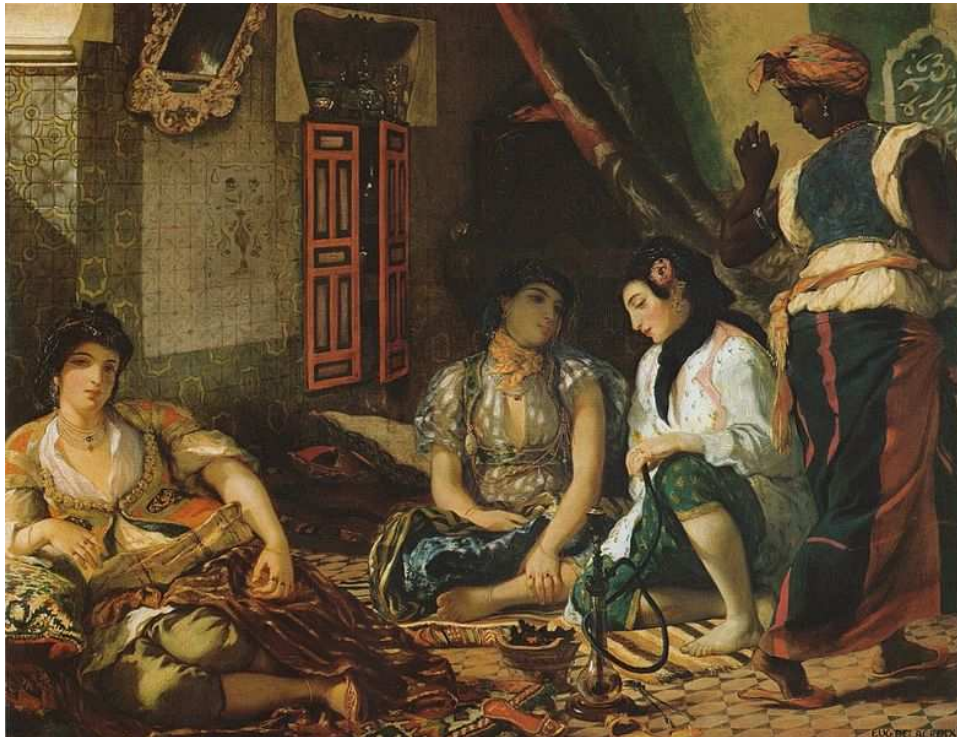
5 Eugène Delacroix, The Women of Algiers , 1832, Oil on Canvas, 180cm x 229cm, Musée du Louvre

After a mere five years, Delacroix traded in his sexually available nude women in exchange for the women portrayed in his painting The Women of Algiers in 1832.