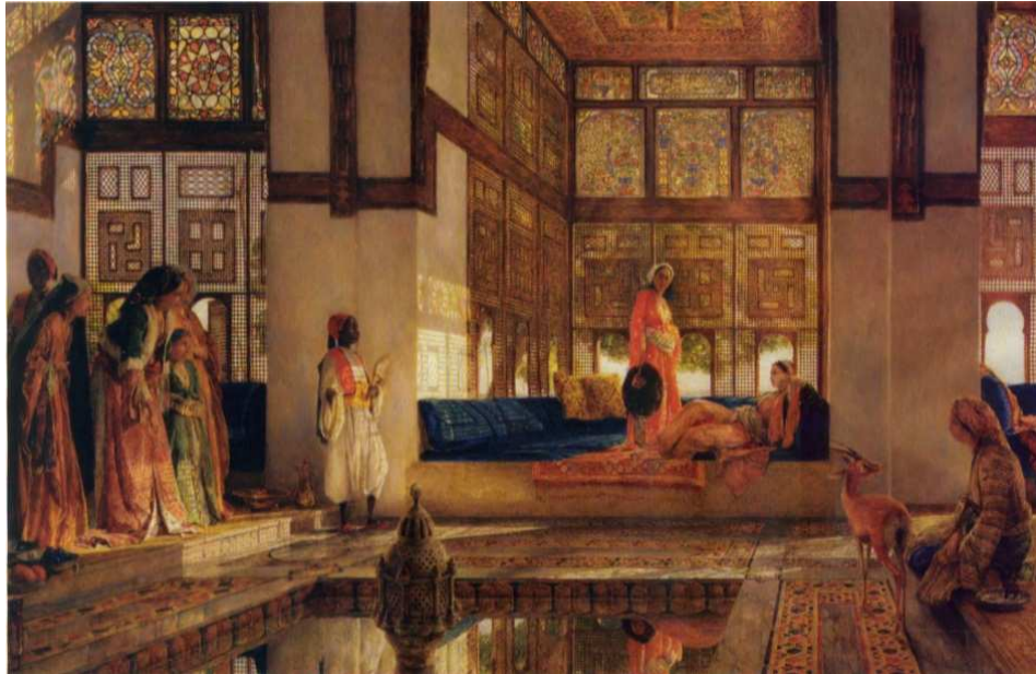
6 John Frederick Lewis, A Lady Receiving Visitors (The Reception) , 1873, Oil on Wood, 63.5cmx76.2cm, Yale Center for British Art, Paul Mellon Collection

His paintings A Lady Receiving Visitors (The Reception) and The Hhareem are of a completely different nature, his focus not resting on the Imperial aspects of dominating women, but rather portraying everyday life and culture in detail and accuracy. In his painting The Reception the viewer is hit with detail of not only the architectural structure of the room, but detail in every other sense: the Egyptian clothing ranging from »long robes, gathered pants, head shawls [and] a fez «, the tiling, the water, the gazelle, the lighting and the colour. 57 »In details... Lewis is at his best.« 58 However, despite this overwhelming amount of detail, »Lewis maintains a sense of order, clarity and visual coherence:« 59 He aims to portray the women not according to Western perceptions, but rather he uses his paintings to introduce his audience to the »Egyptian domestic situation«, presenting it »as being as exquisite and pure as the manner in which it was painted.« 60 The gazelle in the painting is another element of the Egyptian culture captured by Lewis, as it was »a common house-pet of the Egyptian upper classes... endowed with symbolic connotations.« 61