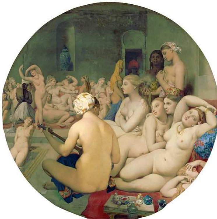
1 Jean Auguste Dominique Ingres, Le bain turc, 1862, Oil on Wood, 108cm x 108cm, Musée du Louvre

Despite never having traveled to North Africa or the Near East, Jean-Auguste-Dominique Ingres is famous for his Oriental paintings. Ingres had a fascination with the women of the Orient, specifically the Odalisques; women who were sex-slaves to the rich upper-class Oriental men. Ingres painted a collection of paintings embodying both Odalisques as well his other fascination: the harems. Inspired by writings such as The Letters written by Lady Mary Wortley Montagu who experienced the Orient first hand, Ingres was able to ›capture‹ the Orient and created his very own »home-grown exoticism«. 26 Lady Montagu's description of the women's bath at Adrianople for example was what sparked Ingres' interest in the portrayal of harems and his initial conception for his painting Le Bain Turc . 27 He took on Montagu's already arguably exaggerated experience of the Middle East and transformed it into an erotic art fantasy. Ingres, along with fellow Oriental artists such as Gérôme and Lecomte du Noüy were »perpetuating a vision of the Orient where erotic dreams could find their fullest expression«. 28