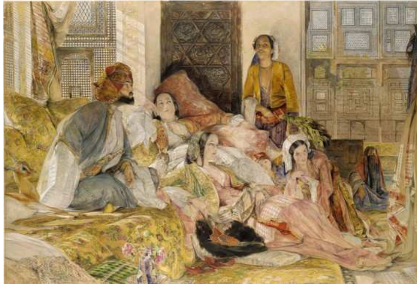
7 John Frederick Lewis, The Hhareem, 1850, Watercolour, 88.6cm x 133cm, Private Collection

The spelling of ›Hhareem‹ adds to the sophistication of the painting, the »double ›h‹ indicating the Arabic letter ح and thereby seeming to announce... a new level of authenticity.« 62 Lewis' portrayal of a harem and what a ›harem girl‹ would look like is worlds apart from the portrayal given by both Ingres and Delacroix; in fact, one might even say that his depictions are modest and delicate. Yet it is fascinating to note that the Illustrated London News , when the painting was exhibited in England, claimed »this is a marvelous picture; such as men love to linger around, but as women, we observed, pass rapidly by. There is nothing in this picture, indeed, to offend the finest female delicacy: it is all purity of appearance.« 63 The harem remained a concept that was frowned upon by Europeans, therefore making it even more sexually arousing for European men. Despite Lewis attempting to provide the viewer with an accurate portrayal of a harem, one must question the »decidedly un-Oriental appearance of the women« 64 as well as »the lack of a veil... [which] would not have been allowed« 65 in his paintings. We must draw from these observations that Lewis must have resorted to European models for his Harem scenes, and that therefore his paintings are strong interpretations of Egyptian harem scenes but not personal observations put on a canvas.