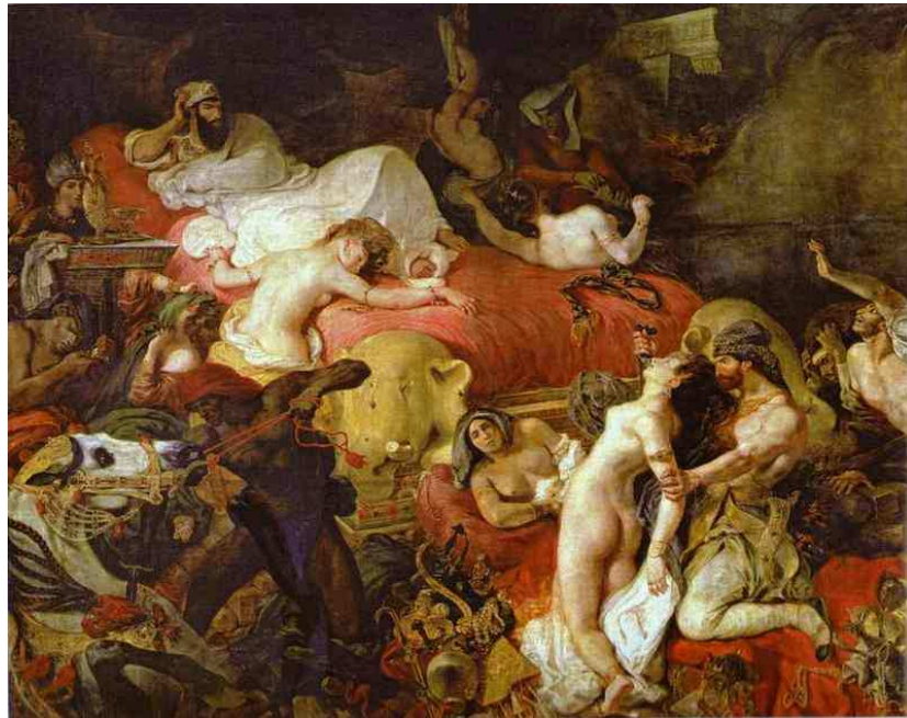
4 Eugène Delacroix, Death of Sardanapalus , 1827, Oil on Canvas, 392cm x 496cm, Musée du Louvre

In the case of the painting Death of Sardanapalus Delacroix based his painting on the 1821 play Sardanapalus by Lord Byron. 47 It is the story of the King of Assyria, who »failed in battle... is about to die [and]... he broods among his intended victims,... his naked slaves are being murdered, and his possessions are being destroyed.« 48 The story is one that allows for the combination of all the generic Oriental elements: treasures, slaves, prostitutes, wealth, a dominant King – it is a canvas that is »full of beautiful chaos.« 49